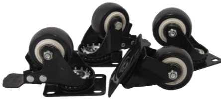
Caster Wheel set

casters are a great solution for data centers and server racks. A&G Networks line of casters are a prime solution for server rack casters because they dissipate electrostatic energy. Electrostatic dissipative material is not anti-static, nor is it conductive.