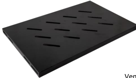
Ventilated Fixed Shelves for free stand cabinets