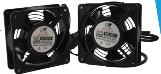
Double Fan 230V