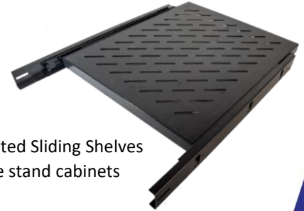
Ventilated Sliding Shelves for free stand cabinets