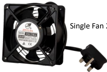
Single Fan 230V

Ventilation in your cabinets is critical for keeping vital equipment cool. An enclosure blower draws cool air from a raised floor at the bottom of the cabinet and delivers it right across the front of servers or other network components.