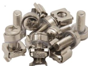
Cage Nut & washers

M6 rails so popular on server cabinets? They're adaptable. With just one cage nut, you can change a square hole into a round one. That gives you much more versatility in your equipment and mounting choices.